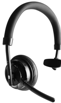
VTX300 BT Mono