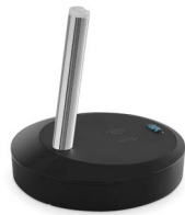
Optional Base Unit