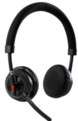
VTX300 BT Duo